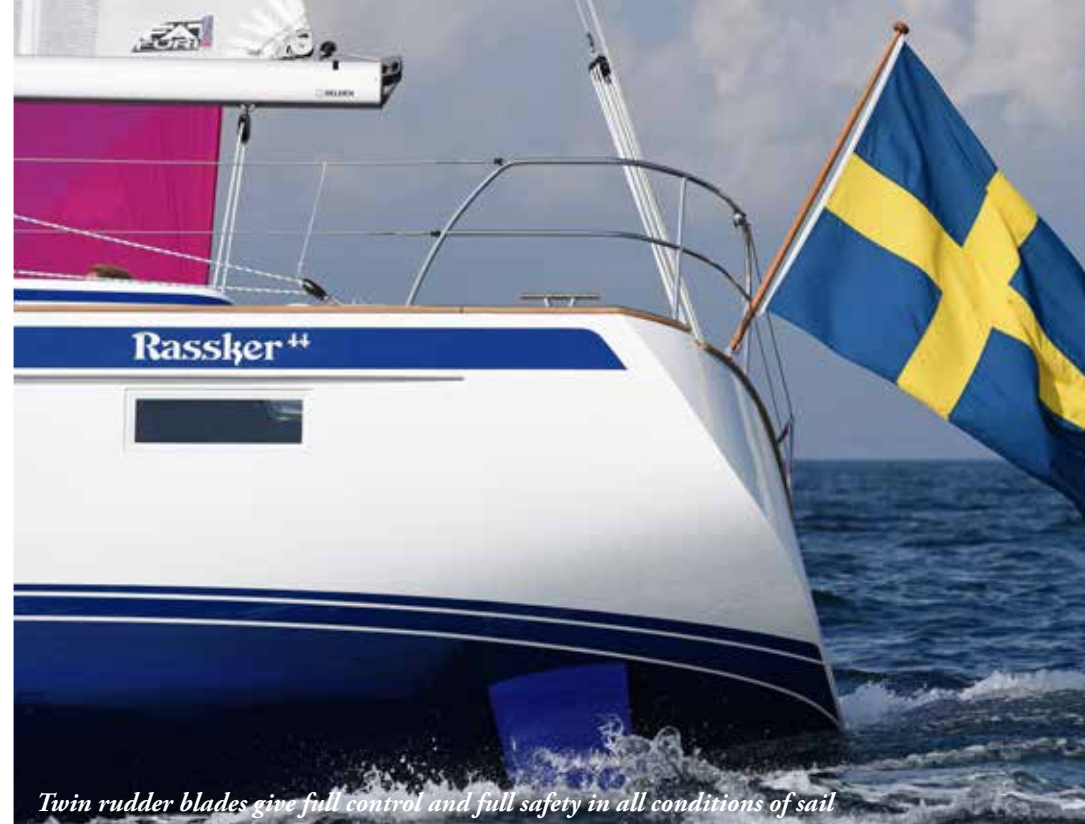
Twin rudder blades give full control and full safety in all conditions of sail