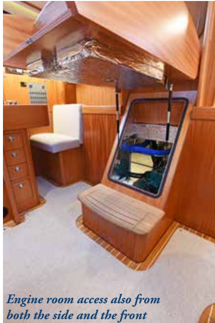
Engine room access also from both the side and the front