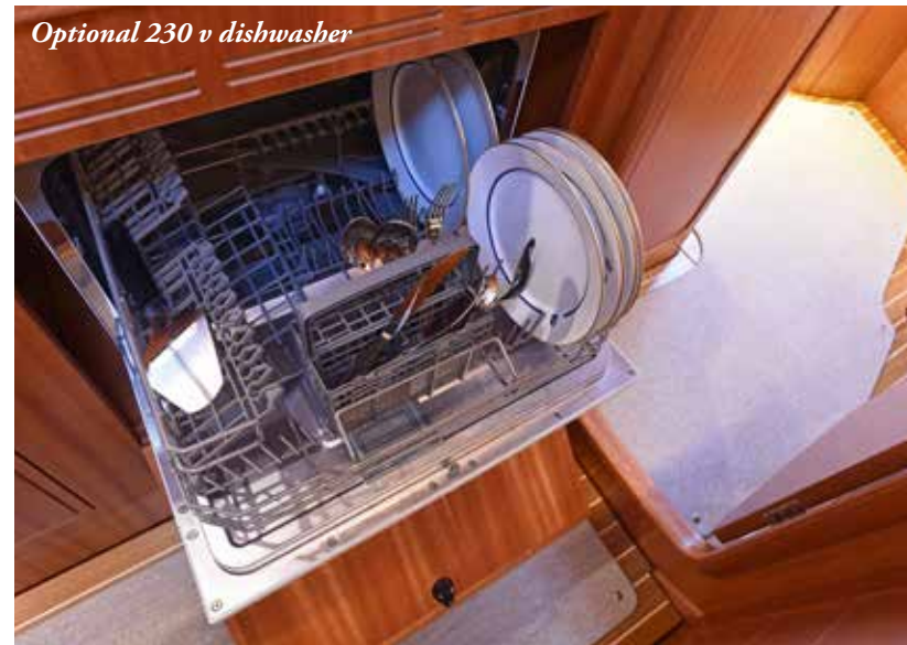
Optional 230 v dishwasher