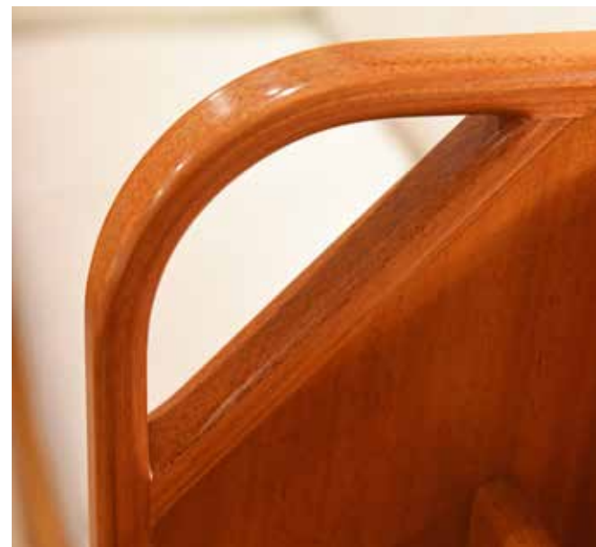
Retractable 32 inch TV