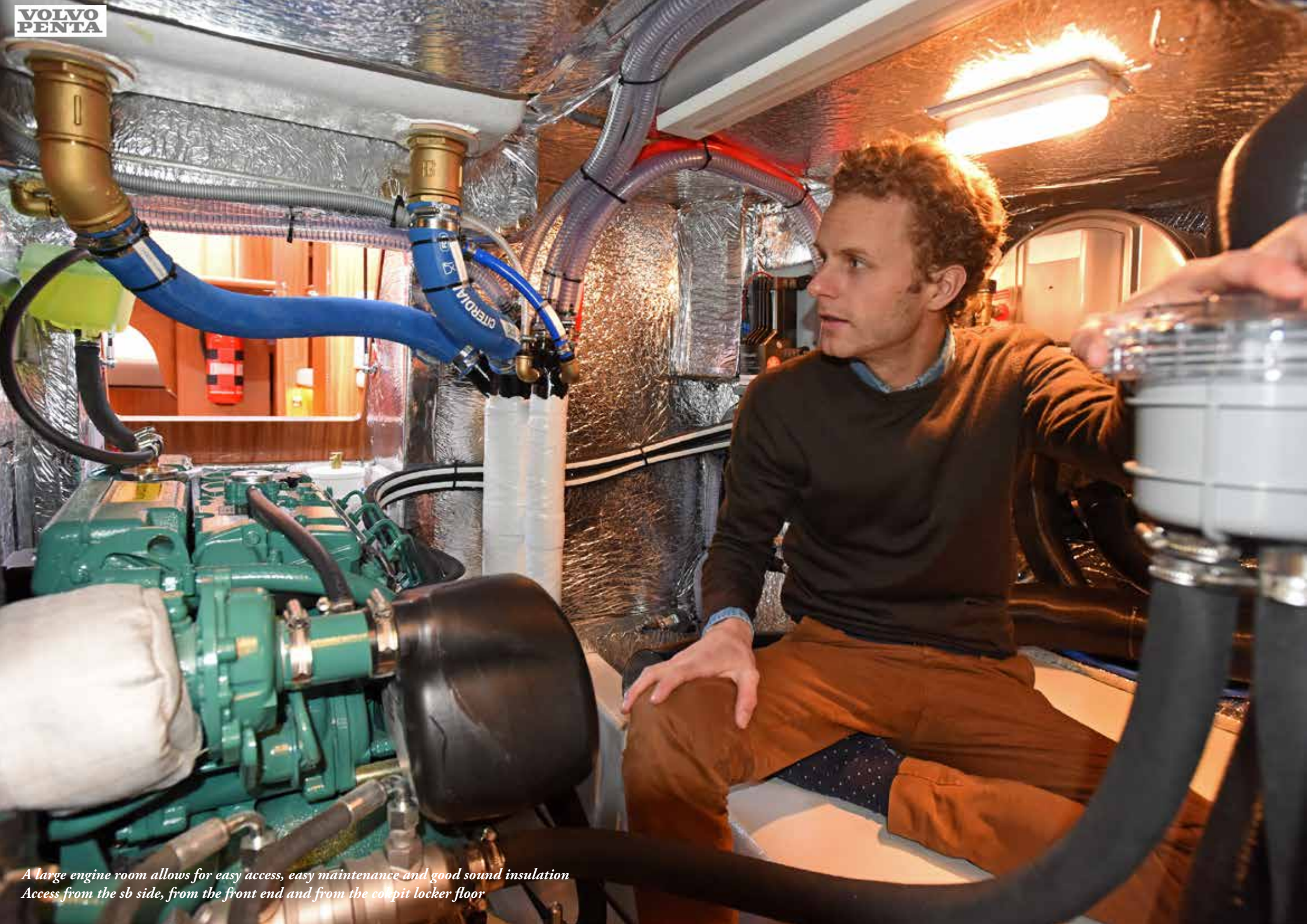
A large engine room allows for easy access, easy maintenance and good sound insulation Access from the sb side, from the front end and from the cockpit locker floor