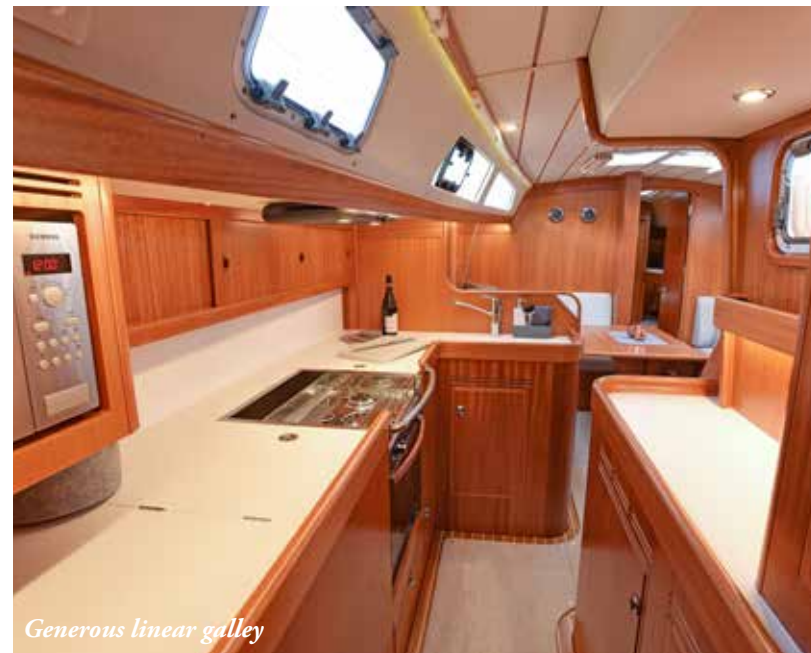
Generous linear galley