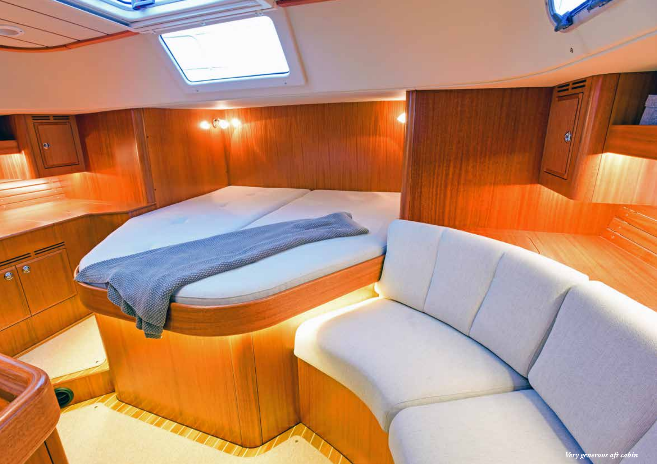
Very generous aft cabin