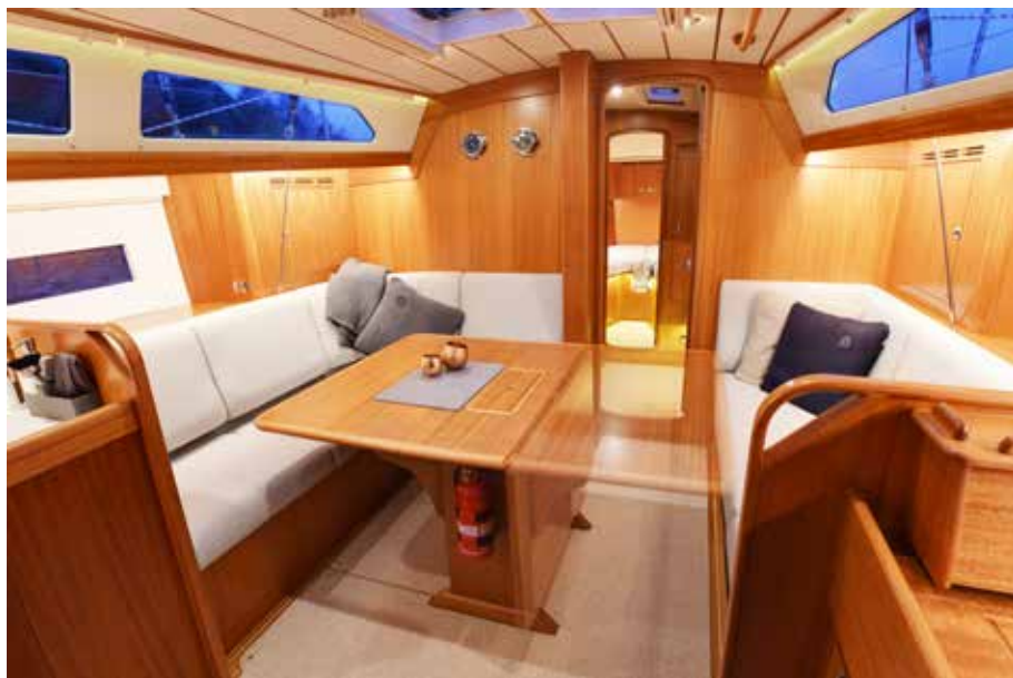
Bright and inviting saloon with lots of natural light