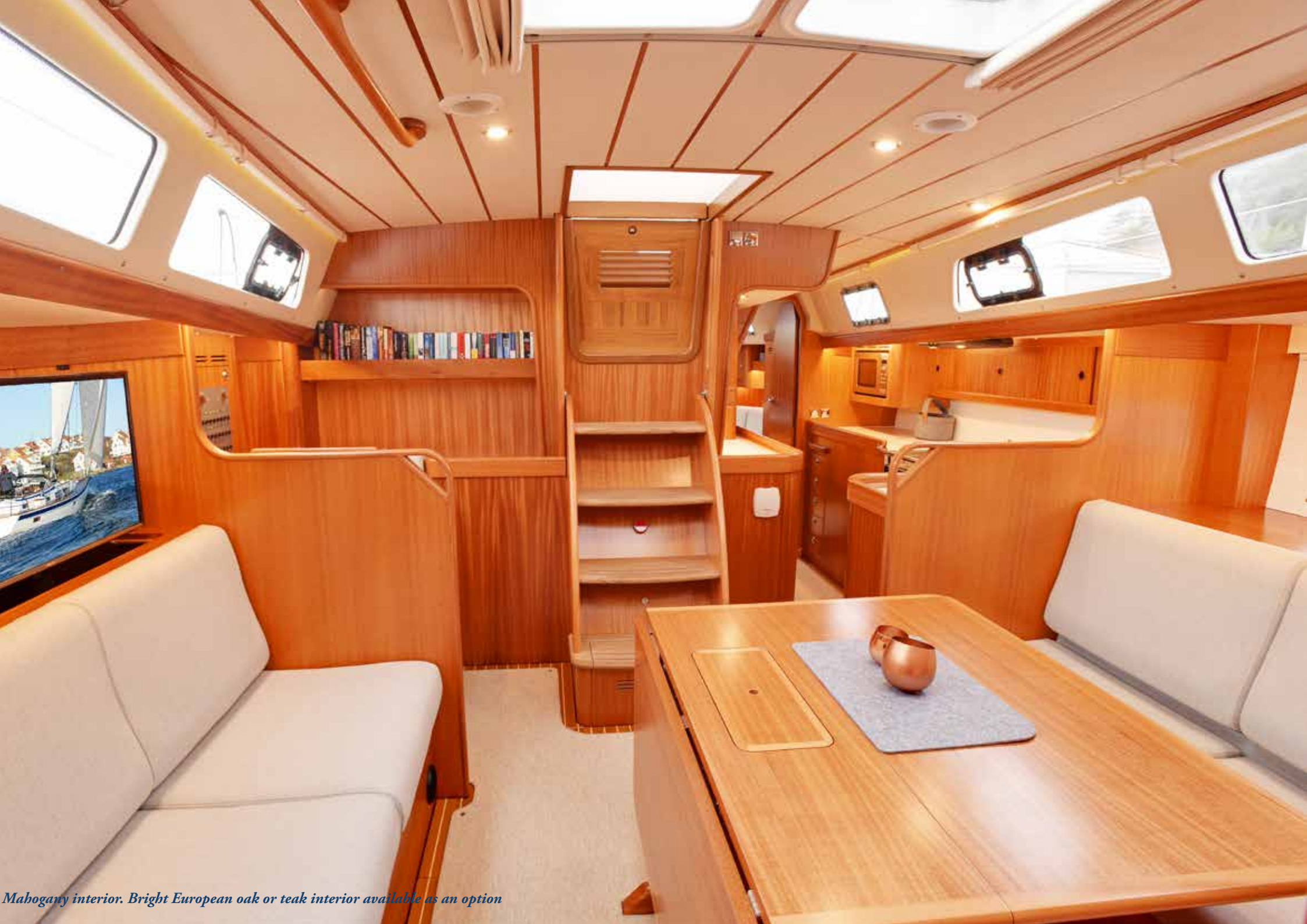
Mahogany interior. Bright European oak or teak interior available as an option