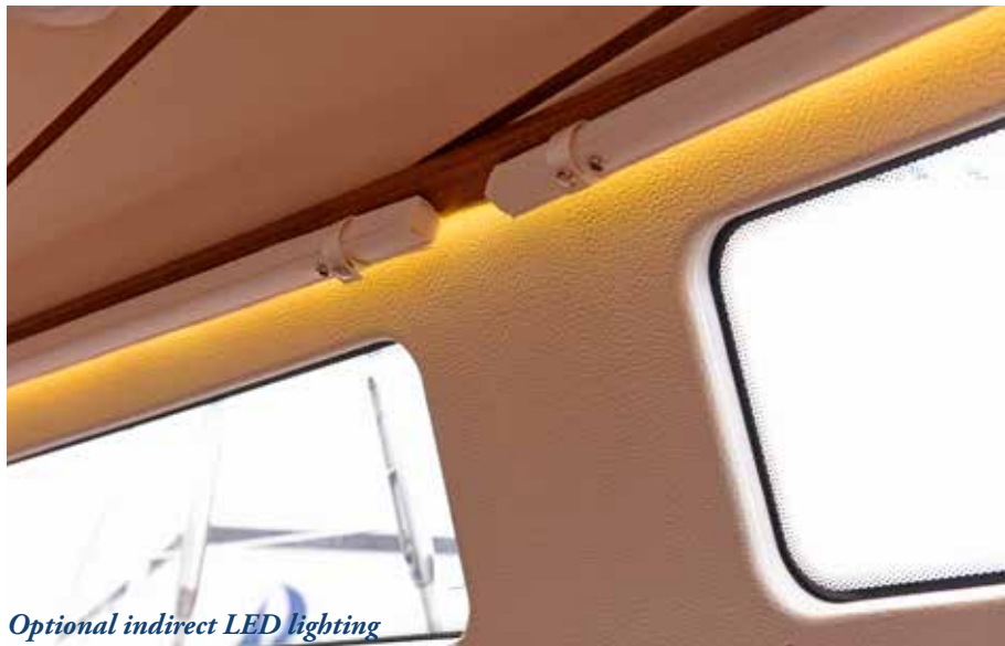
Optional indirect LED lighting